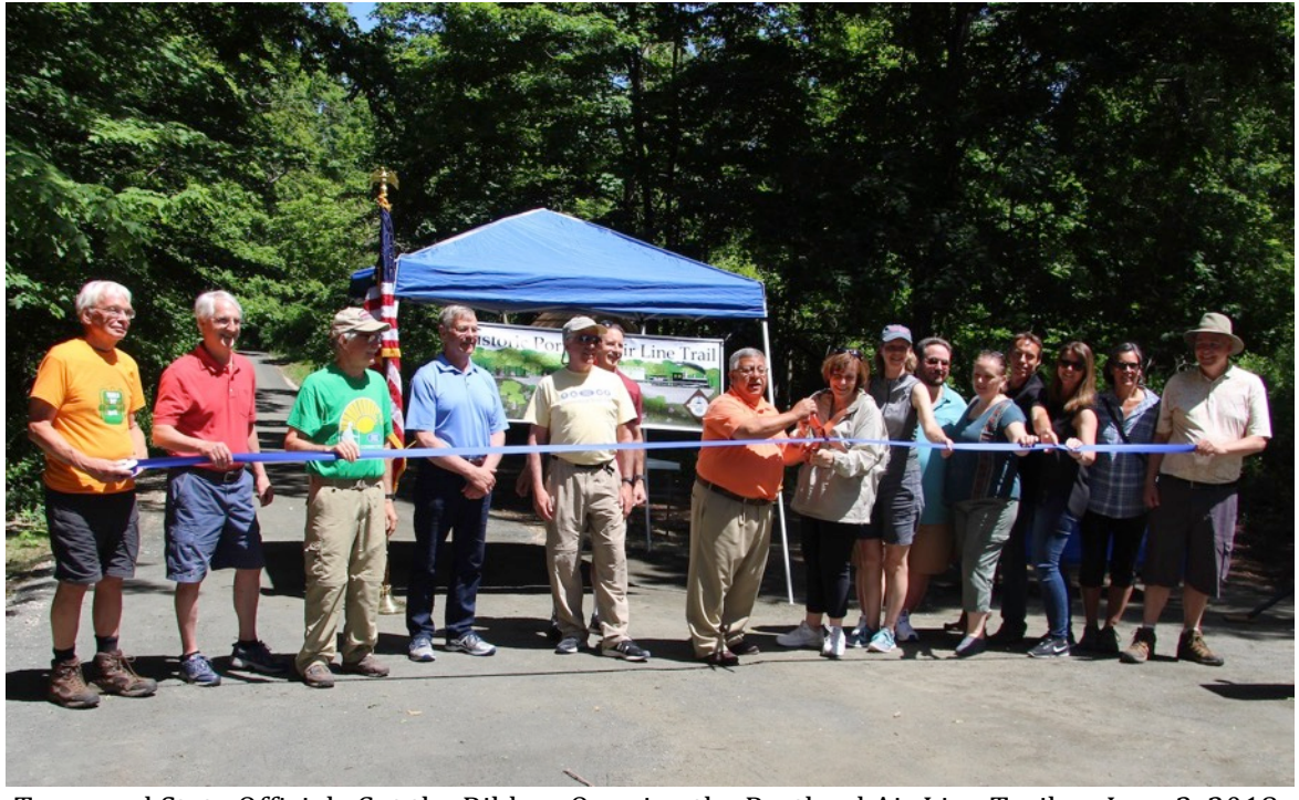
Town and State Officials Cut the Ribbon Opening the Portland Air Line Trail on June 3, 2018.